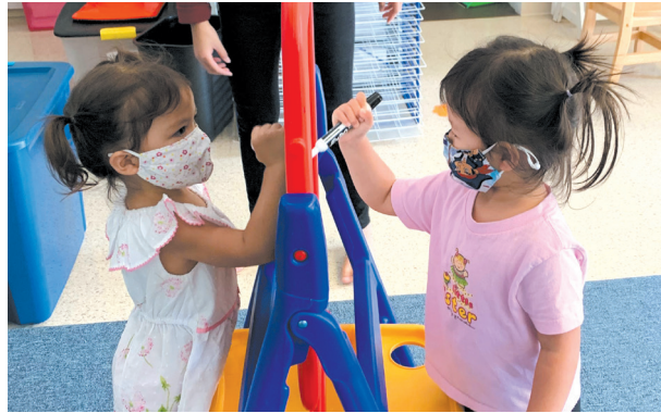
(Above and right) Keeping a sense of normalcy is important for Keiki Care Center of Hawai'i, which requires its kids to wear masks.

"We're constantly laughing and enjoying our time